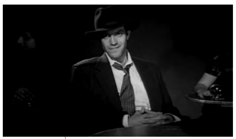
Humming, dir. Ben Waters (2003)