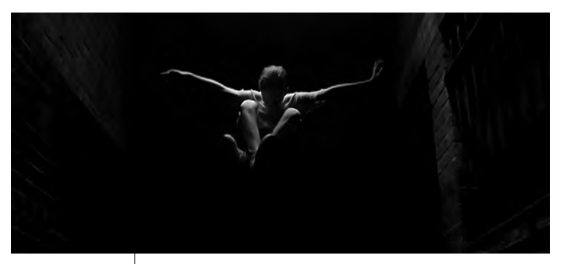
Only You, dir. Chris Cunningham (1998)