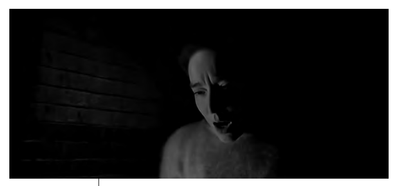
Only You, dir. Chris Cunningham (1998)