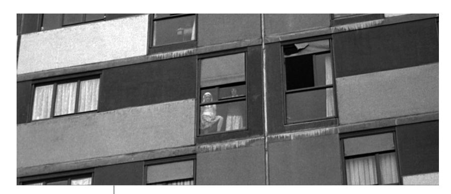
Fig. 2. Two girls in the housing estate where Juliette lives

Juliette is not the only person in this shot who is dominated by the gigantic, grid architecture, which is an equally important protagonist of the film. In a window at the upper edge of the frame, two young inhabitants can be recognized (Fig. 2). In addition, a little later in the film another shot of the façade shows two girls leaning through the window;<sup>17</sup> they seem delighted to be filmed.